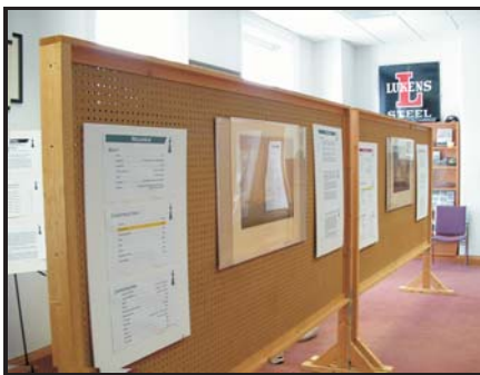
America's Cup Exhibit