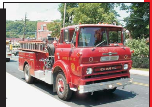
1964 Lukens Fire Truck