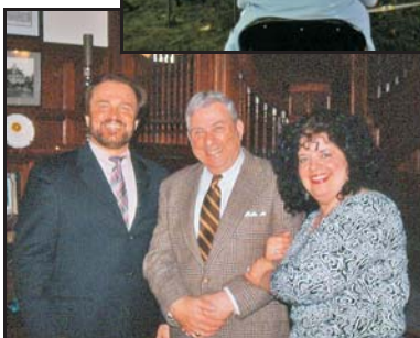
Spring Concert at Graystone