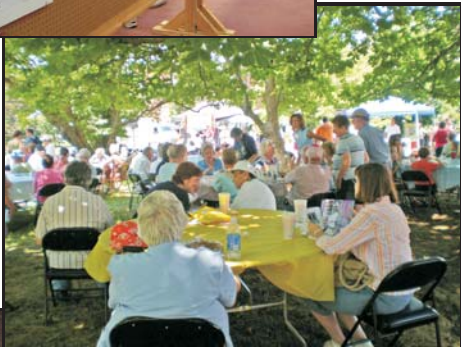
Victorian Ice Cream Festival