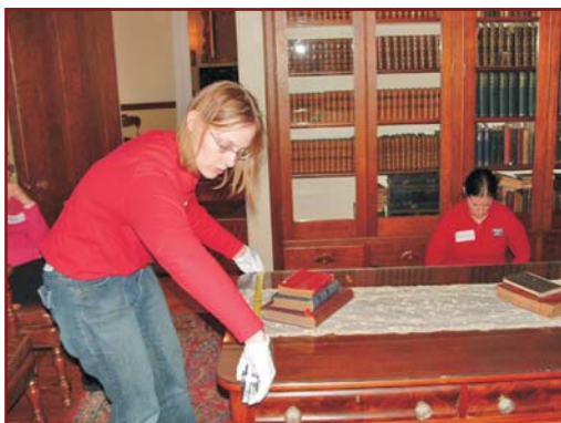
Precise measurements are taken, and all information is added to the collections database.

After an initial orientation and lunch, the PastPerfect staff broke into teams and worked with volunteers and staff from Graystone on objects in the Lukens Executive Building, and Terracina. Another team went to the Tenant House to learn how to input data on the computers.