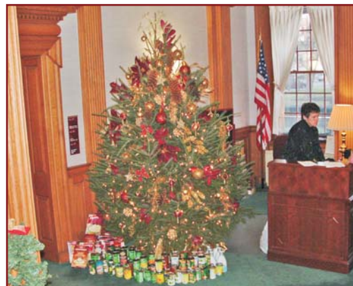
Some of the food items collected for the Coatesville Food Cupboard under the tree.