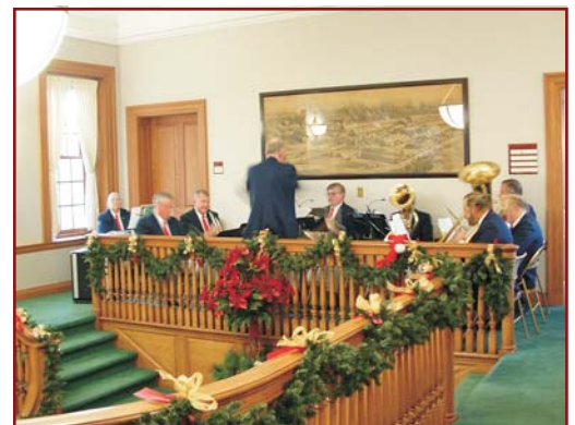
The Lukens Band in the Lukens Executive Office Building.