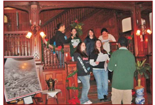
Middle School Choir singing in Graystone Mansion.

The 2008 Holiday House Tours were a huge success with a doubling of the attendance we had in 2007. People of all ages toured the buildings in the Historic District decorated for the holidays. Terracina was decorated in Victorian fashion and featured the only Santa in town. Once again the Lukens Band played at the Executive Office Building, also the site of our annual can drive to benefit the Coatesville Food Cupboard. This year over _____ food items were collected for distribution to needy families in the area.