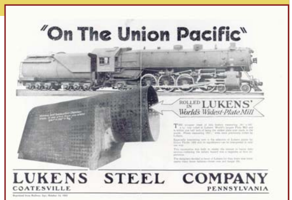
An ad for the Union Pacific and Lukens Steel. The benefit of a single sheet can be seen here. Seams where two plates are welded together are weak spots.