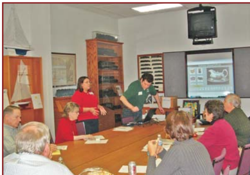
PastPerfect staff explaining how data is input to Graystone volunteers.

The staff of PastPerfect , which is based in Exton, PA, are experts on the software, but decided that it would be a helpful to get real-time experience. Instead of a having traditional Holiday Party this year, they decided to volunteer at a local museum and use their skills to do some actual object accessions.